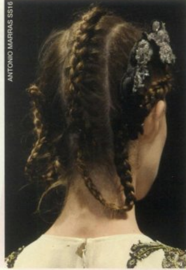
ANTONIO MARRAS SS16